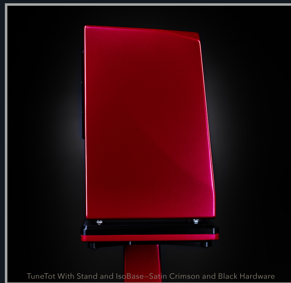
TuneTot With Stand and IsoBase—Satin Crimson and Black Hardware

The bottom plate is also machined from 6061-T6 aluminum. Spikes can be installed into the bottom plate for greater stability on carpeted floors. Both plates are available in either black or clear anodize.