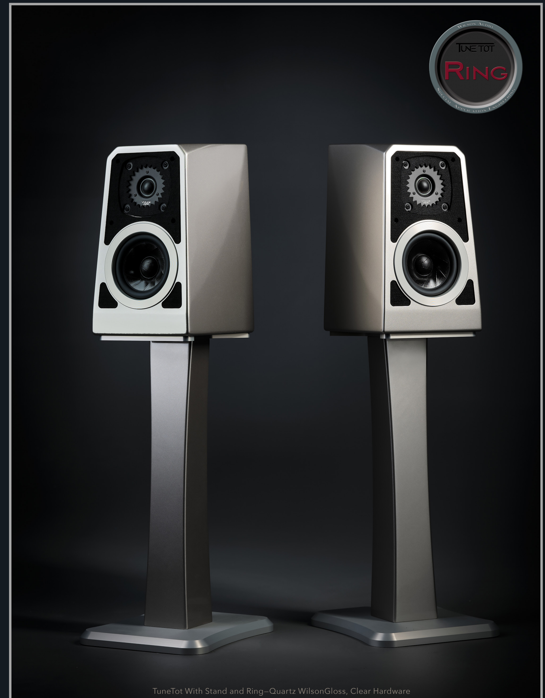
TuneTot With Stand and Ring—Quartz WilsonGloss, Clear Hardware

ISOBASE INSTALLATION SURFACE OPTIMIZATION