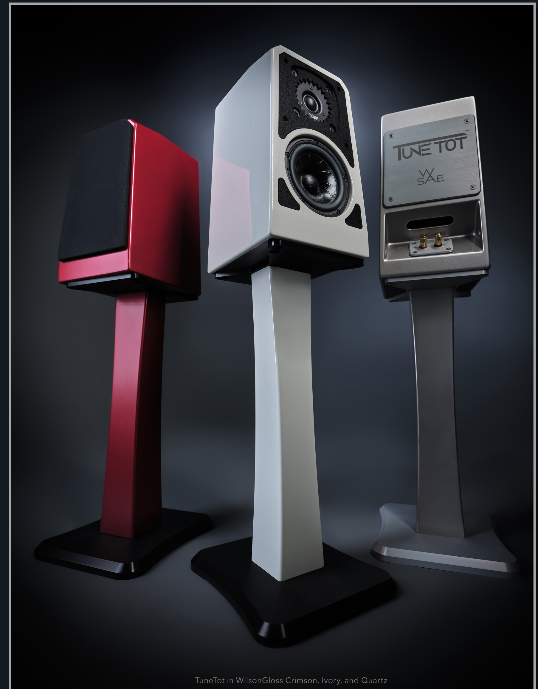
TuneTot in WilsonGloss Crimson, Ivory, and Quartz

A custom-machined, solid billet of X-Material serves as the column riser. It is extremely inert and massive. X-Material, now in its third design iteration, is unique among composites for its remarkable combination of dampening characteristics and rigidity. The column is painted using our WilsonGloss process and is available in a range of colors to match or complement the TuneTot.