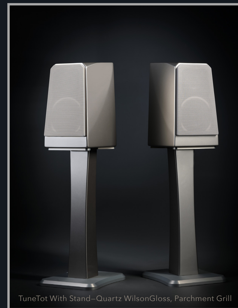
TuneTot With Stand—Quartz WilsonGloss, Parchment Grill